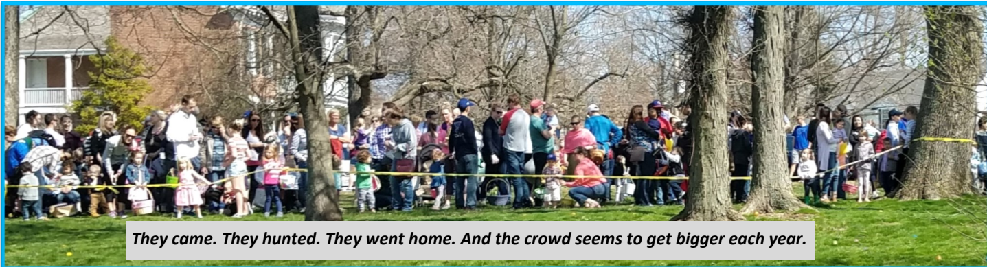
They came. They hunted. They went home. And the crowd seems to get bigger each year.